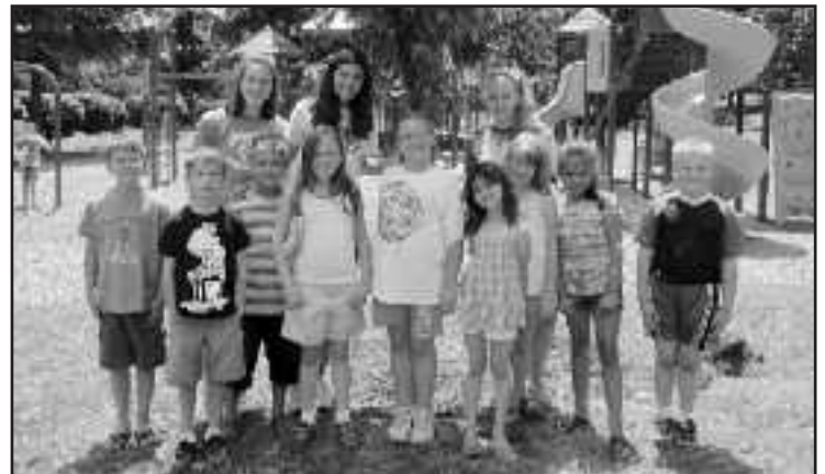
Summer Youth Program plants a tree at Bruce Henry Park

Loyalsock Township is always looking for people to help out in the parks department. If you are interested in helping your community please contact Shannon Lukowsky at 323-6151.